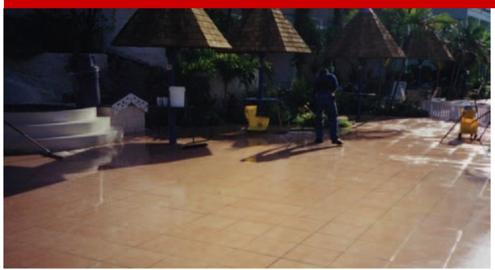
Porcelain Pool Deck, Leading Hotel, Barbados